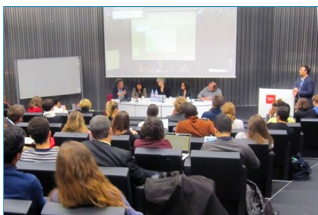
Event during the international Strategy and Networking Workshop in Geneva, October 24