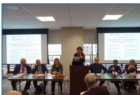
Side event on 8 December in New York