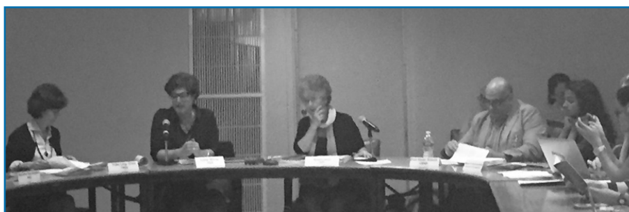
Side event during the High-Level Political Forum for Sustainable Development, 11 July

Side event on the occasion of the High-Level Political Forum for Sustainable Development: “2030 Agenda for Sustainable Development: A Good or Bad Start?” (11 July 2016 at the United Nations Headquarters in New York). During the event, the roundtable discussed the main obstacles to achieving the SDGs such as transnational spill over effects that influence or even undermine the implementation of the goals and current policy approaches, as they are reflected, inter alia, in the 2030 Agenda, an adequate response to the challenges and obstacles. At the side event key findings and recommendations of the report Spotlight on Sustainable Development were presented. The event was organized in cooperation with the Arab NGO Network for Development (ANND), Development Alternatives with Women for a New Era (DAWN), Social Watch, Third World Network, and Friedrich-Ebert-Stiftung.